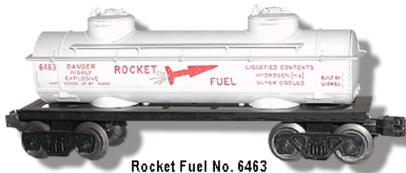
Rocket Fuel No. 6463

Finally a non oil company tank car! In the 1960's Lionel sought to capitalize on the US space program. Flat cars with rockets and space capsules obviously need rocket fuel. The white plastic tank is supported by a sheet metal chassis. The trucks are open plastic AAR with magnetic disk couplers