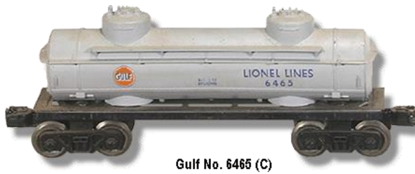
Gulf No. 6465 (C)

Made in 1958 sporting a Gulf Oil logo, this grey plastic tank car has a sheet metal chassis. The trucks are plastic closed AAR with magnetic disk couplers.