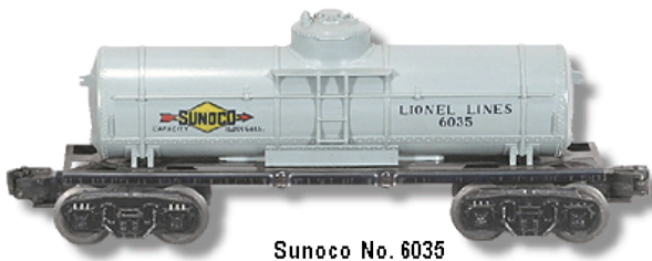
Sunoco No. 6035

Sunoco single dome tank car with sheet metal chassis, plastic tank, molded ladder, and hand rails. Made in 1952 and 1953. This car has scout type trucks with magnetic couplers.