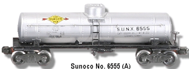
Sunoco No. 6555 (A)

This single dome tank car has a metal silver tank with metal ladders, wire hand rails, brake wheel, and sheet metal chassis. Made in 1949 and 1950, it is one of the few cars in the collection with die cast staple end trucks and coil couplers.