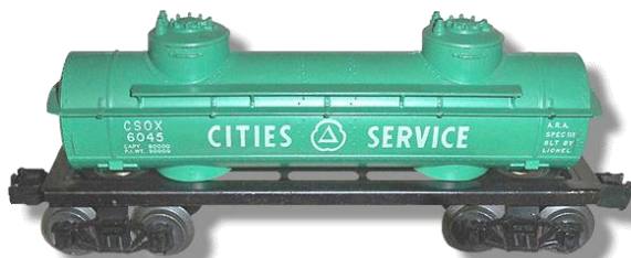
Cities Service No. 6045

Made in 1960 and 1961 this green Cities Service car has a plastic tank and sheet metal chassis. It has plastic arc bar trucks with fixed couplers